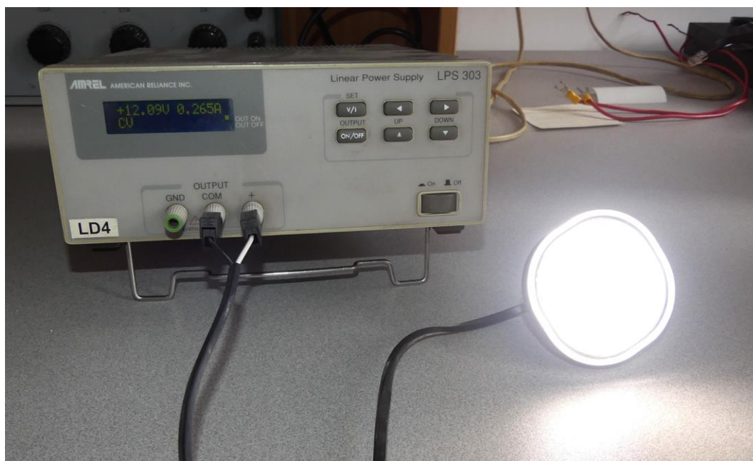
Photography 7: Sample 6029.10 – LED Lamp type FT-410 during functional test after IPX8 test

Small amount of water did penetrate into tested object, but it did not affect safety or interfere with the proper operation of the device (electrical live parts are protected by a hermetic seal). Functional test involving connection every LED section to power supply (12-24 V DC) and lighting check – passed. Test result positive.