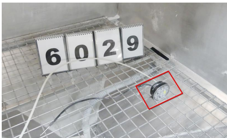
Photography 3: Sample 6029.9 – LED Lamp type FT-410 (marked with red line) during the IP6X test