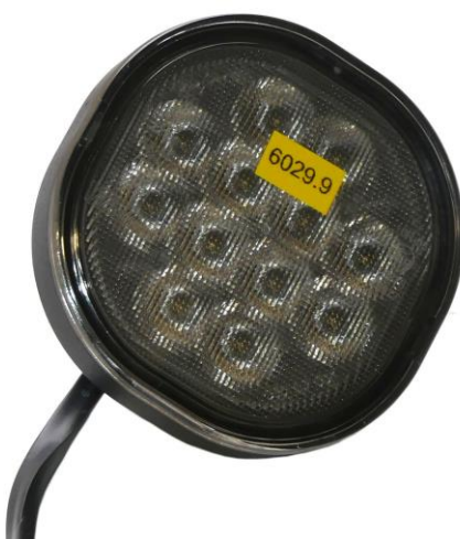
Photography 1: Sample 6029.9 – LED Lamp type FT-410 (to be tested on IP5X)