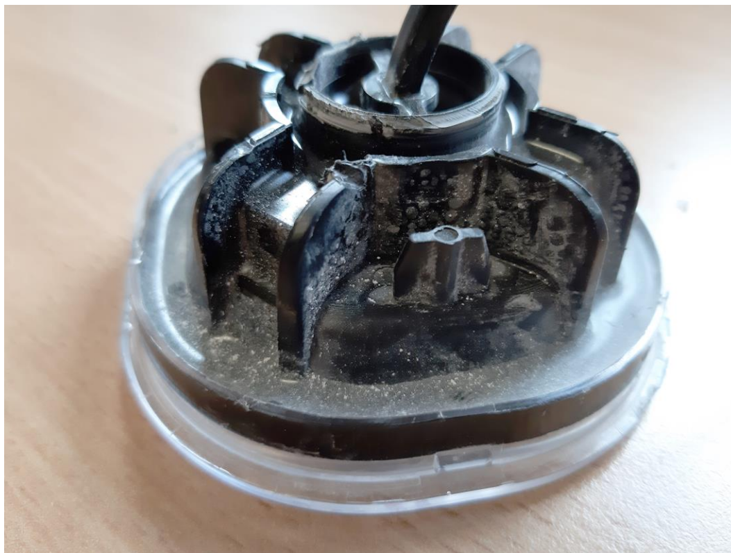
Photography 5: Sample 6029.9 – LED Lamp type FT-410: Small amount of dust did penetrate into tested object, but it did not affect safety or interfere with the proper operation of the device.