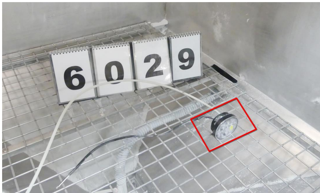
Photography 3: Sample 6029.9 – LED Lamp type FT-410 (marked with red line) during the IP5X test