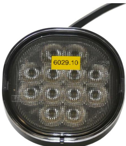
Photography 2: Sample 6029.10 – LED Lamp type FT-410 (to be tested on IPX8)